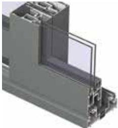
Slim Line middle section