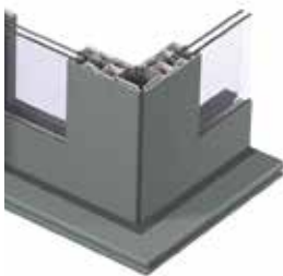
Open corner system