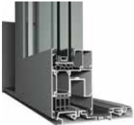
Low threshold option